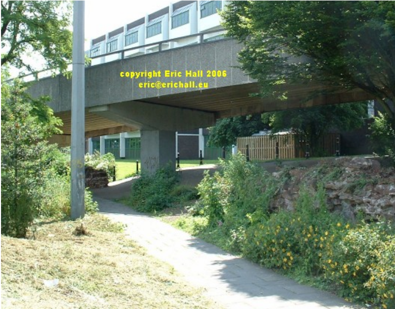
Photograph taken by the writer in July 2006 showing demolition of part of the medieval city wall to permit the erection of a support for the city's ring road.