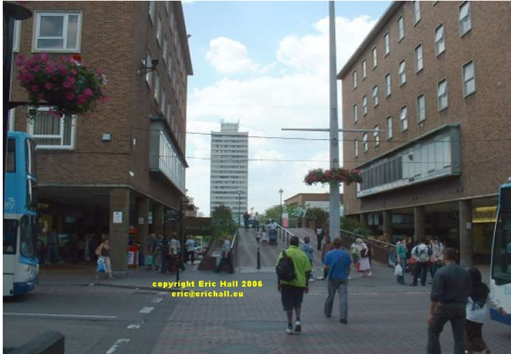
The ramp that was installed to ease access to the upper floor of the shopping precinct. Photograph taken July 2006.