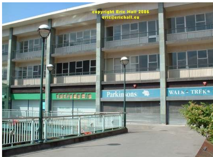
Photograph taken by the writer in July 2006 showing more empty shops on the upper floor of the Broadgate Shopping Centre.