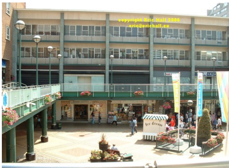
Photograph taken by the writer in July 2006 showing the lower and upper floor of the Broadgate Shopping Centre. Note the empty shops on the upper floor.