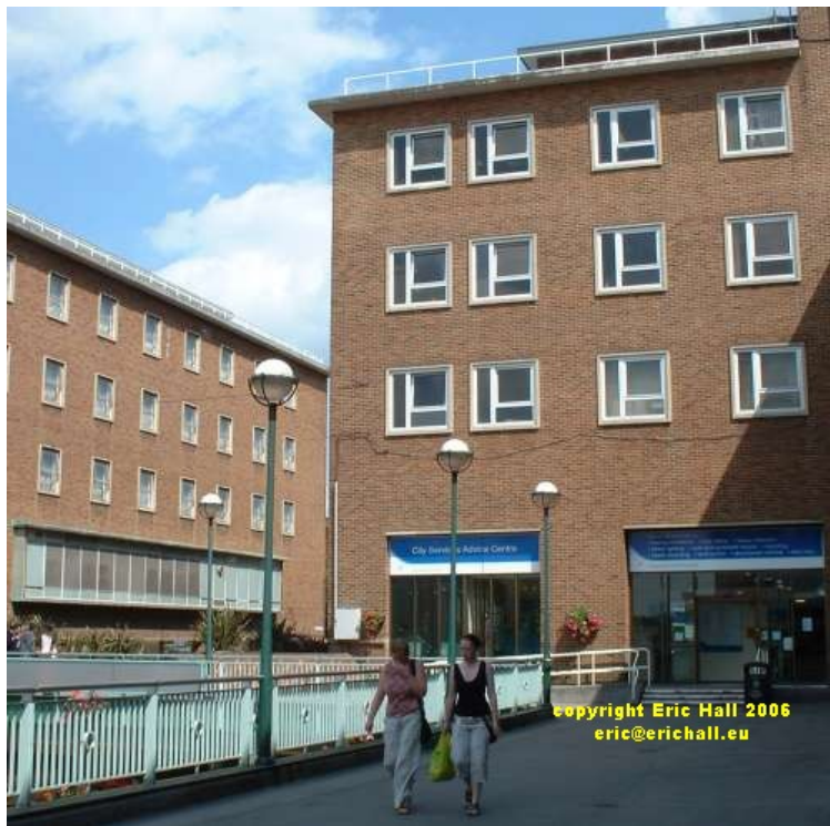
The entrance to Broadgate House – now offices for the city council and formerly a feature multi-level department store.